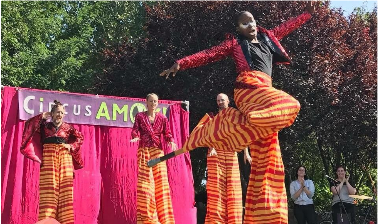
Circus Amok Performers Dance on Stilts.